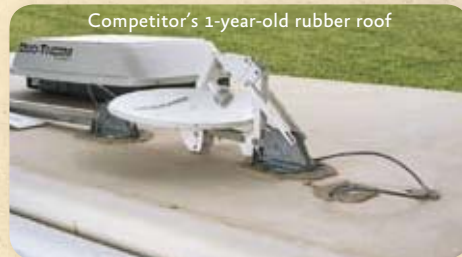
Competitor's 1-year-old rubber roof

Fiberglass Roof The Journey and Journey Express both feature a crowned, one-piece fiberglass roof, backed with a 10-year limited parts-and-labor roof skin warranty. Fiberglass offers superior strength, attractiveness and durability over the rubber roofs found on many competitive models which can chalk, streak and degrade over time. Fiberglass also provides increased puncture and tear resistance.