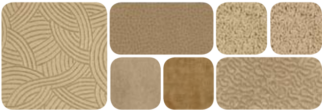
Roundabout with Briarwood UltraLeather