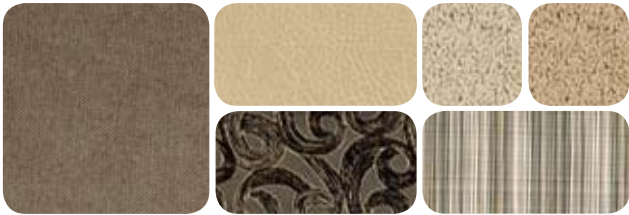
Wrought Iron with Wheatfields UltraLeather™