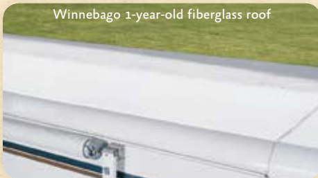
Winnebago 1-year-old fiberglass roof

Thermo-Panel ® Sidewalls Invented by Winnebago Industries, Thermo-Panel construction combines a fiberglass panel, high-density block-foam insulation and aluminum support structures to create some of the most long-lasting, lightweight sidewalls in the industry.