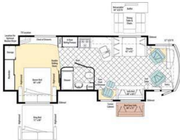
Journey Express 34Y