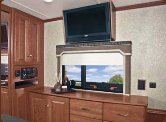
TV/Stereo The 26" LCD HDTV is positioned for optimal viewing and the available stereo system with a CD/DVD player lets you drift off to sleep with your favorite music.

Several bed options ensure a restful night at every stop. The standard queen bed can be upgraded to a king or queen Ideal Rest® body-conforming mattress that molds to your body for perfect support. The Journey 40L and 40T offer a Sleep Number® Bed by Select Comfort™ for those that want adjustable firmness on each side of the bed. An electric adjustable bed is also available on the 39N, allowing you to sit up to watch TV or read a book. It's fun to travel with kids in the Journey Express 39N with bunk beds that easily convert into a second wardrobe. It only adds to the plentiful storage in the spacious and luxurious bedroom.