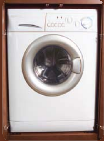
Washer/Dryer Add the washer/dryer and enjoy the convenience of fresh laundry without the laundromat.