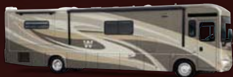
Journey Express TAUPE PEARL FULL-BODY PAINT