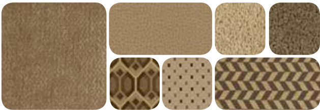
Courtyard with Briarwood UltraLeather