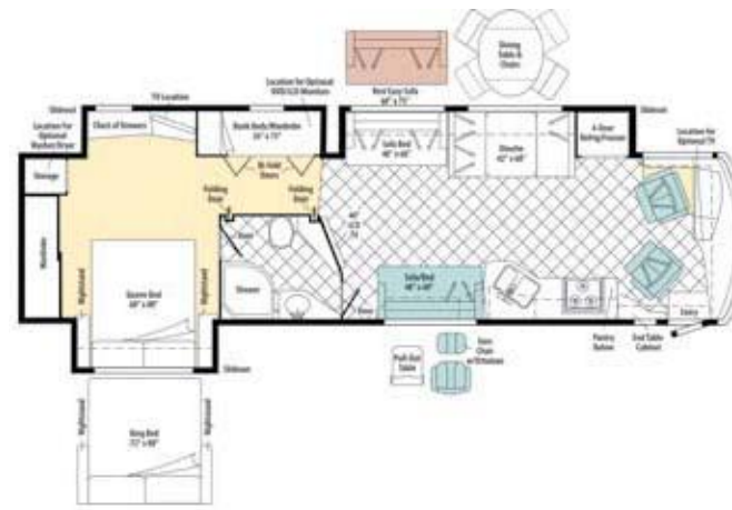
Journey Express 39N